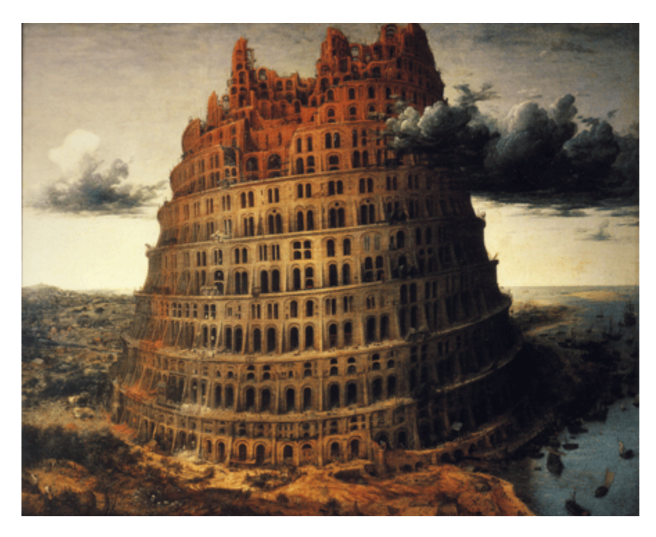
Fig. 1: The Tower of Babel by Pieter Brueghel the Elder (1563)

The story of the tower of Babel (probably derived from the ancient Sumerian myths around their great towers, or ziggurats) is well known [figure 1]. Divine intervention shattered humanities single language into a multiplicity of tongues, thus sowing confusion (balal is the Hebrew word 'to confuse'). To describe the structural and advocacy constructs in Europe and the USA as 'Towers of Babel' underestimate the scale of the problem. There is little interest in cancer research policy making circles about questions of dependence and interdependence, asymmetrical relations amongst funders and countries, centre-periphery relations or indeed in research imperialism. And yet considering the scale of cancer research activity, investment and the socio-political prominence that it enjoys such questions must be addressed. Without this understanding it is seriously questionable whether any major funder, country or representational body can honestly construct a strategy that has external validity.